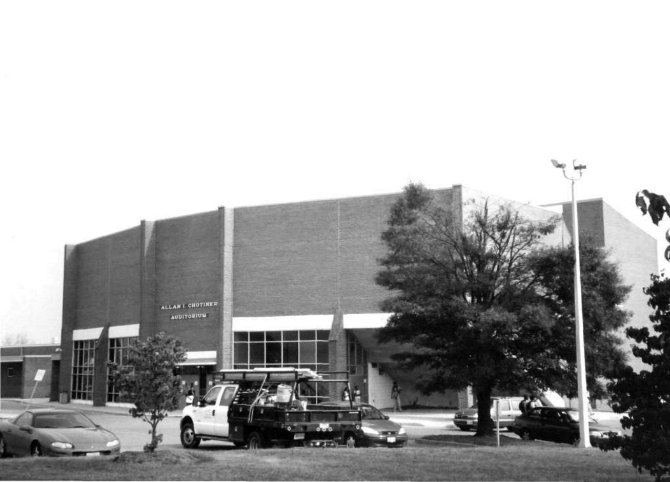
ALLAN I. CHOTINER AUDITORIUM